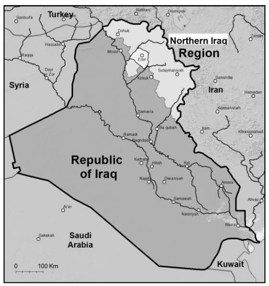
Figure 2. Northern Iraq Map

Those four governorates cover approximately 40,000 square kilometers which is larger than the Netherlands, Bahrain, and four times the area of Lebanon. This include the governorates administered by KRG, but does not contain areas of Kurdistan outside of KRG administration, such as Kirkuk (Soderberg, and Phillips, 2015).