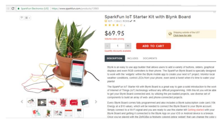
Figure 1. Diverse kinds of smart kits which make the control of the living conditions of potted plants easier (Sparkfun Website)

Today science and technology gives us enough power to build the necessary infrastructure and provide and control the needed artificial conditions for potted plants such as adequate climatic conditions, watering (irrigation) and feeding (fertilization) even with smart tools (Figure 1) - this recalls the idea of smart cities.