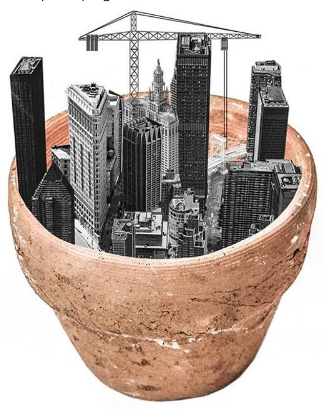
Figure 4. An Urban Area in A Pot, By Serap Sonmez (Sonmez, 2018)

Looking at the below image of a potted city and imagining the replantation of these structures in a forest resembles a violent action similar to agriculturalization of forest lands, or passing huge pipelines from the middle of forests or more similarly dumping construction wastes into forests.