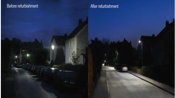
Figure 3. Before and after the refurbishment in a street in Bielefeld, Germany ("Road, paths and squares", 2014).

Using LED lights usually increases light levels and achieves better lighting quality that improves visibility and thus drivers and public safety ("Road, paths and squares", 2014). In some cases there has also been observed a reduction in crime rates between 07:00pm and 07:00am; in crimes such as vehicle theft, burglary, robbery and vandalism. Additionally, the positive contribution of light bulbs with a recommended color temperature of 3000K indicates that lighting can improve safety and driving safety, as well as contributing positively to the health of road users.