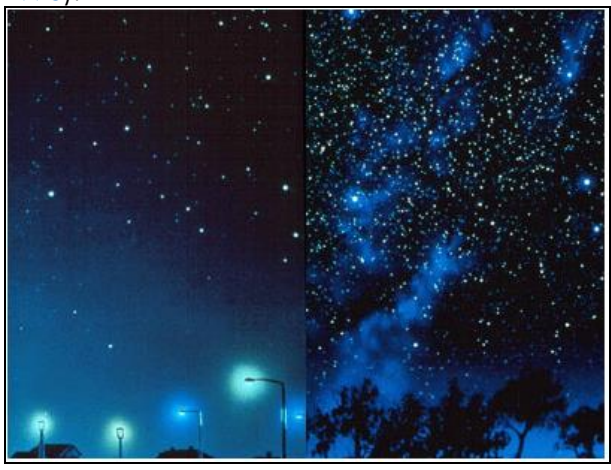
Figure 2. Before and during the 2003 Northeast blackout, a massive power outage that affected 55 million people.

Additionally, the phenomenon of light pollution does not leave astronomy unaffected (Walker, 1973).