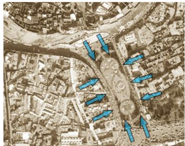
Figure 3. New Centers near the citadel pushing out Source Developed by the author.

The transformation from the ambiguity to uniformity in the form of new space in the central area lead to loss of the diversity of the space and make something similar to an international space in the old central area. At the same time using the same material in all around the old citadel create a feeling of repetitive with enforced rapture with the old skin.