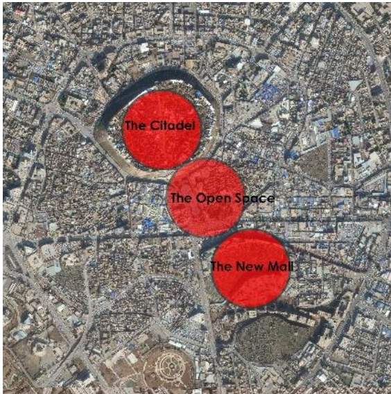
Figure 4. Both side of the new square development with sharp contrast.