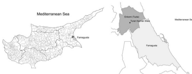
Figure 1. Cyprus Map, location of Famagusta city and "Turan Kaynak Sitesi" at proximity of Enkomi (GIS developed by author).

"Turan Kaynak Sitesi" which is one of the famous and sprawl town in Famagusta district at a proximity of "Enkomi" (Turkish: Tuzla) village at 35°09'N and 33°53'E (Figure 1), this town can be called as one of the earliest urban sprawl town in Famagusta district which is constructed in about 1994 and town had an area of 56 896 m 2 with 63 buildings which are detached, semidetached and apartment units, most of the inhabitants are affluent, they are with variety of the occupation, nation, age, gender, marital status, ethnic and etc. data collection was based on interview, observation and document analyze from the "Turan Kaynak Sitesi" as case study.