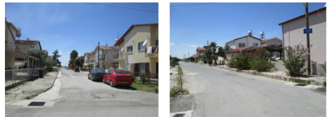
Figure 2. Inadequate greenery and lack of sidewalk, "Turan Kaynak Sitesi" April, 2015 (Photos taken by author).

Most of the town inhabitants were not aware of sprawl and related impact into their daily life, most of them during interview even understand impacts of urban sprawl and this directly related to lack of awareness, still between inhabitants there are some people who willing to return into neighborhood, however some of them has reason to stay.