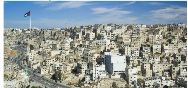
Figure 2. Homogenized Building Create an Ugly City and Lack of Sense of Place for Users (URL 1).

and more compromising life of future generation. Moreover, aesthetical characteristics are other crucial parameters in architectural design but the consideration was neglected in the built environment and constructions (Schoon, 1992). It is so clear that identity plays a significant role in civic life and individuals' culture however cities, spaces and building can't achieve sense of belonging for the users (Fig.1).